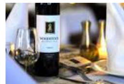
This Month's Special