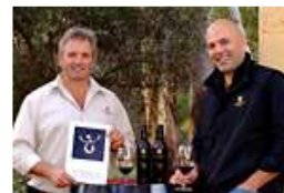
Download Order Form